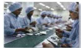
Utilise Skilled Work Forces