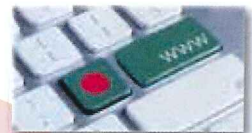
Outsource to Next IT Guru