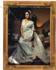
Silk Muslin Fashion show