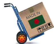
Make in Bangladesh Global Duty Free Exports