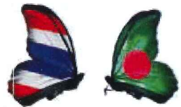
Business Match Making Buy from Bangladesh